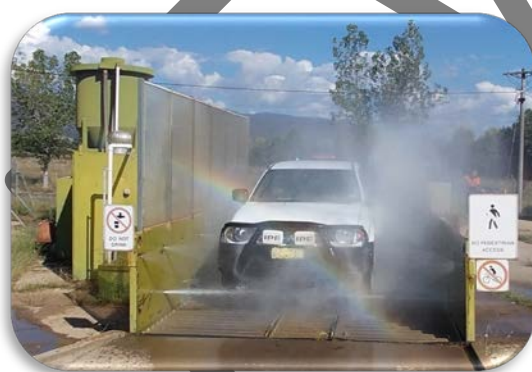
Figure 5. Snowy Valley’s vehicle wash-down bay.