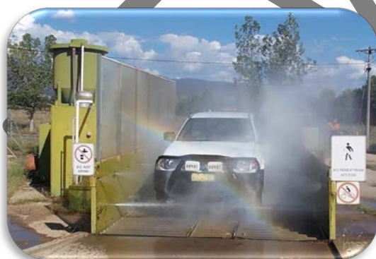
Figure 5. Snowy Valley's vehicle wash-down bay.