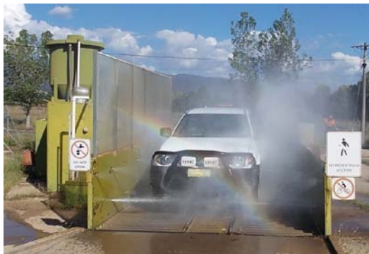
Figure 5. Tumbarumba Shire’s vehicle wash down bay.